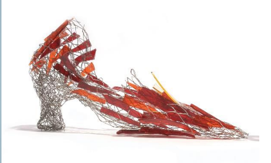
The Duchess of Alba after Francisco de Goya, 2003